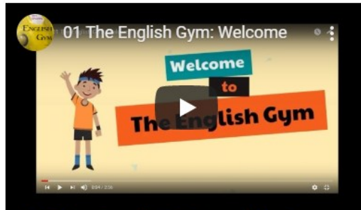
01 The English Gym: Welcome

englishgymjapan.com/video-tutorials-for-teachers