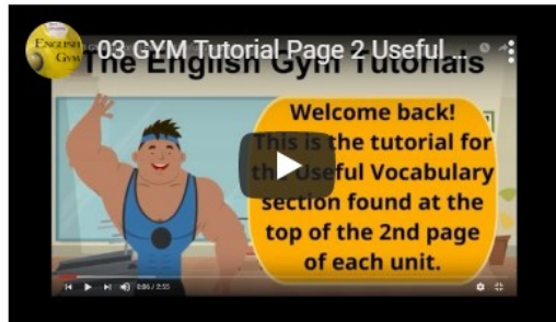
03 GYM Tutorial Page 2 Useful Vocabulary